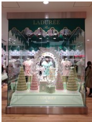
Ladurée and Uniqlo graphic tees collaboration.