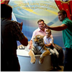
Russian Circuses Offer Animals as Props