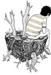
Private Lives: My Life, Post Exposure