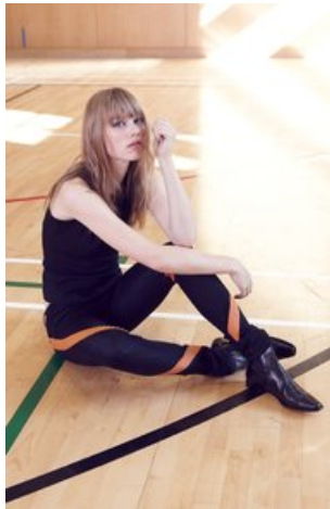
Hussein Chalayan and Mavi Jeans collaboration.

Call it the week of unlikely friendships. Fashion's arch conceptualist Hussein Chalayan is collaborating on a capsule collection of good old-fashioned denim with Mavi Jeans. Of course, not everything is basic blue in the Mavi-Chalayan collaboration: the 15 styles include dark wash skinnies with a high-shine metallic band snaking from waist to heel ($200). At Brooklyn Industries, 290 Lafayette Street, brooklynindustries.com