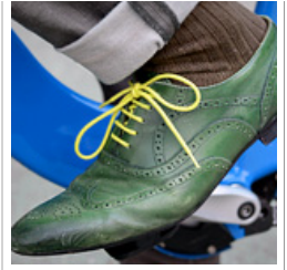
Looking Smart on the Pedals

Room for Debate asked eight novelists to read excerpts aloud from books they would take to the beach.