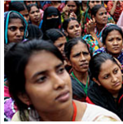
U.S. Retailers Offer Plan for Safety at Factories