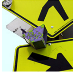
Penthouse Views, No Elevator